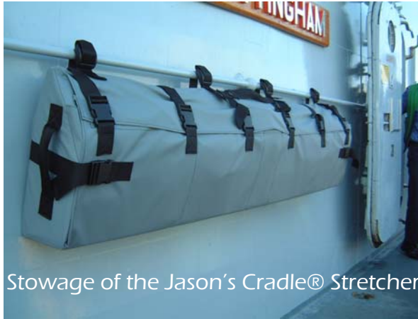
Stowage of the Jason's Cradle® Stretcher