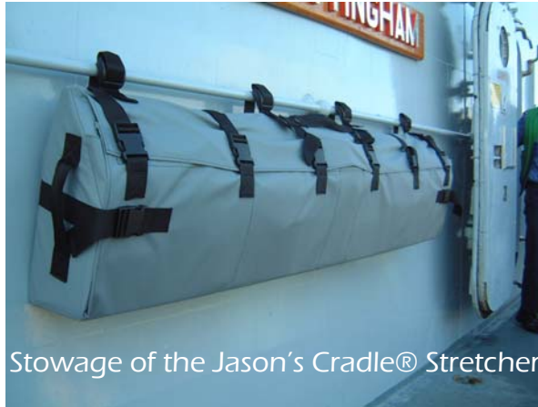
Stowage of the Jason's Cradle® Stretcher