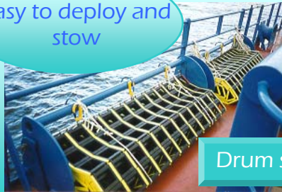
Easy to deploy and stow