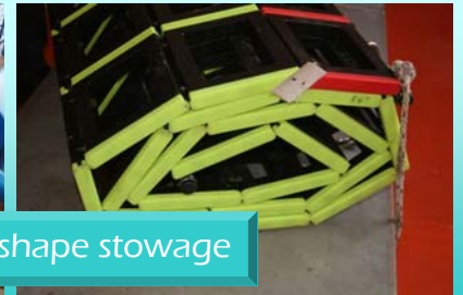
Drum shape stowage

Our bespoke service offers the flexibility to meet all your requirements by tailoring the Jason's Cradle® system to suit any vessel.