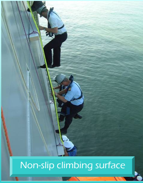
Non-slip climbing surface