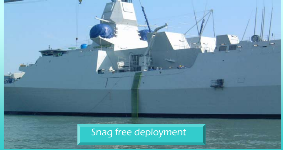
Snag free deployment