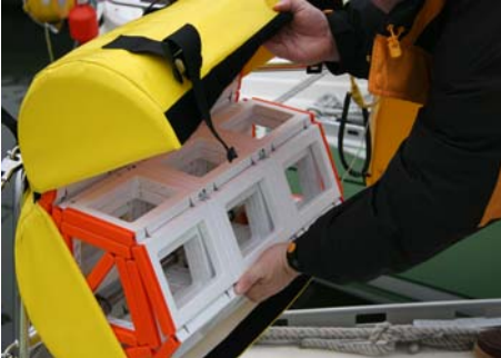
1. Remove Cradle from stowage bag.