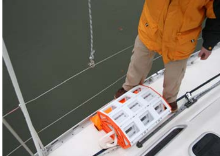
2. Position the equipment at the rescue zone.*/**