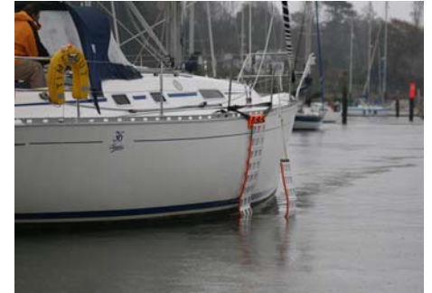
6. Lower Cradle into the water ready for rescue.

* Rescue Zone – This is generally amidships which gives the helmsman optimal viewing capabilities during rescue and is the best location for the use of the equipment