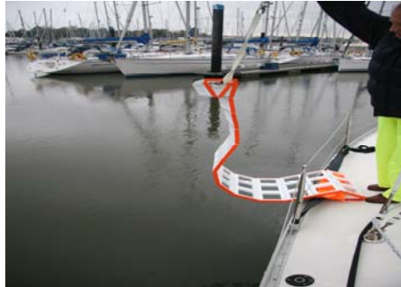
5. Uncoil and deploy outboard.