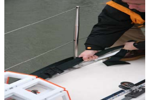
3. Pass straps around two stanchions clip together and tighten.