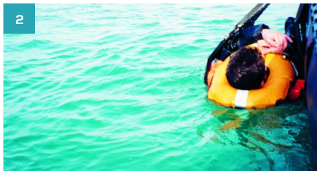
2 Due to the scoop configuration the casualty can be floated into the cradle with minimum effort.