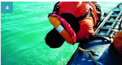
4 The lift takes no longer than 5 seconds due to the cradles 2 to 1 mechanical advantage.