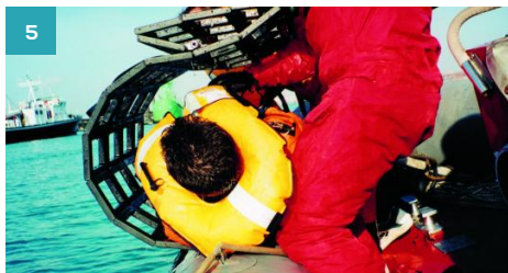
5 The casualty is then face up on the sponson and first aid can commence if necessary.

CALL US ON +44 (0)1202 874365 EMAIL US AT INFO@JASONSCRADLE.CO.UK OR VISIT WWW.JASONSCRADLE.CO.UK