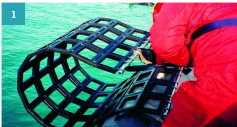
1 Deployment of the cradle forms a non collapsible scoop.