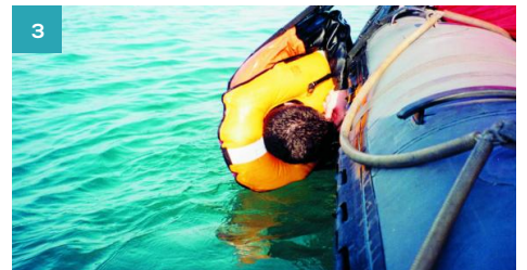
3 A co-ordinated and methodical lift takes place and the casualty is retrieved in the medically preferred and recommended horizontal position..