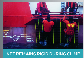
NET REMAINS RIGID DURING CLIMB

CALL US ON +44 (0)1202 874365 EMAIL US AT INFO@JASONSCRADLE.CO.UK OR VISIT WWW.JASONSCRADLE.CO.UK