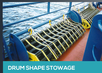
DRUM SHAPE STOWAGE