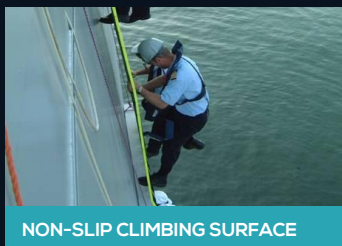
NON-SLIP CLIMBING SURFACE

All Jason's Cradle® units carry our manufacturer warranty of 3 years excluding clips, strops, hauling lines, stowage bags and other additional fittings that carry the usual 1 year manufacturer's warranty.